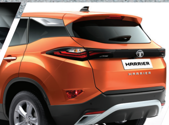
Stunning Impact Design 2.0 Extraordinary Exteriors and Luxurious Interiors