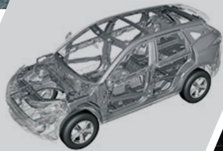
Pedigree of Ω ARC Derived from Land Rover's D8 Architecture