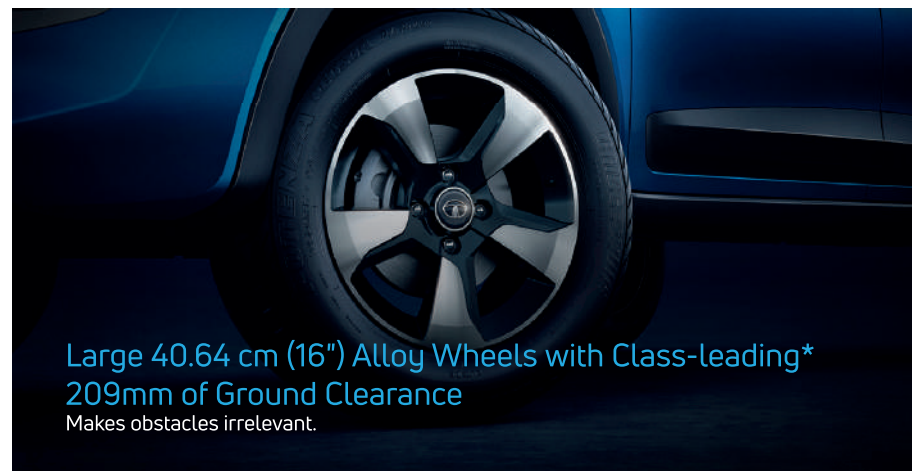
Large 40.64 cm (16") Alloy Wheels with Class-leading* 209mm of Ground Clearance Makes obstacles irrelevant.

All-new petrol and diesel engines with powerful & sporty performance. Turbocharged , with a power output of 110PS (80.9kW) to set your heart racing.