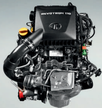
1.2L Revotron Petrol Engine (170 Nm torque)

Absolute control for every drive. Cornering stability with anti-lock braking system and electronic brake-force distribution in all 4 wheels with hydraulic assistance for emergency braking.