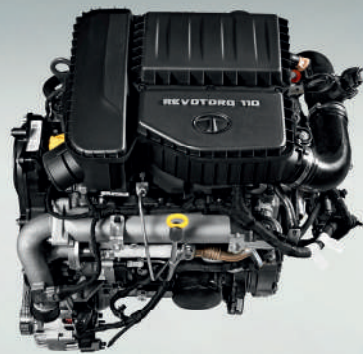
1.5L Revotorq Diesel Engine (260 Nm torque)

All-new petrol and diesel engines with powerful & sporty performance. Turbocharged , with a power output of 110PS (80.9kW) to set your heart racing.